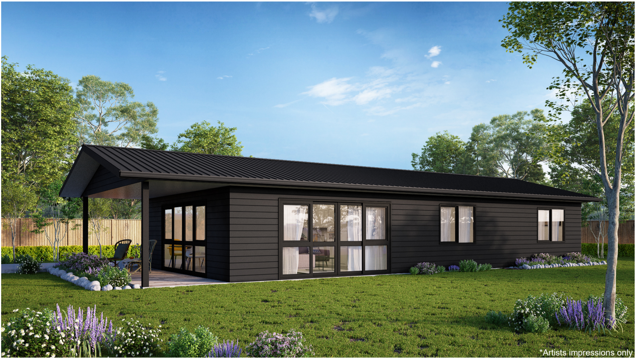
*Artists impressions only