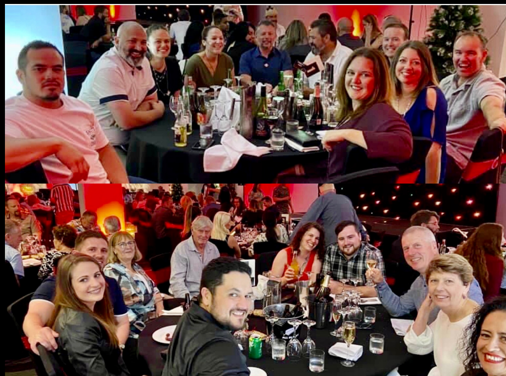
Great night out for the KDH Christmas function at Sky City Hamilton