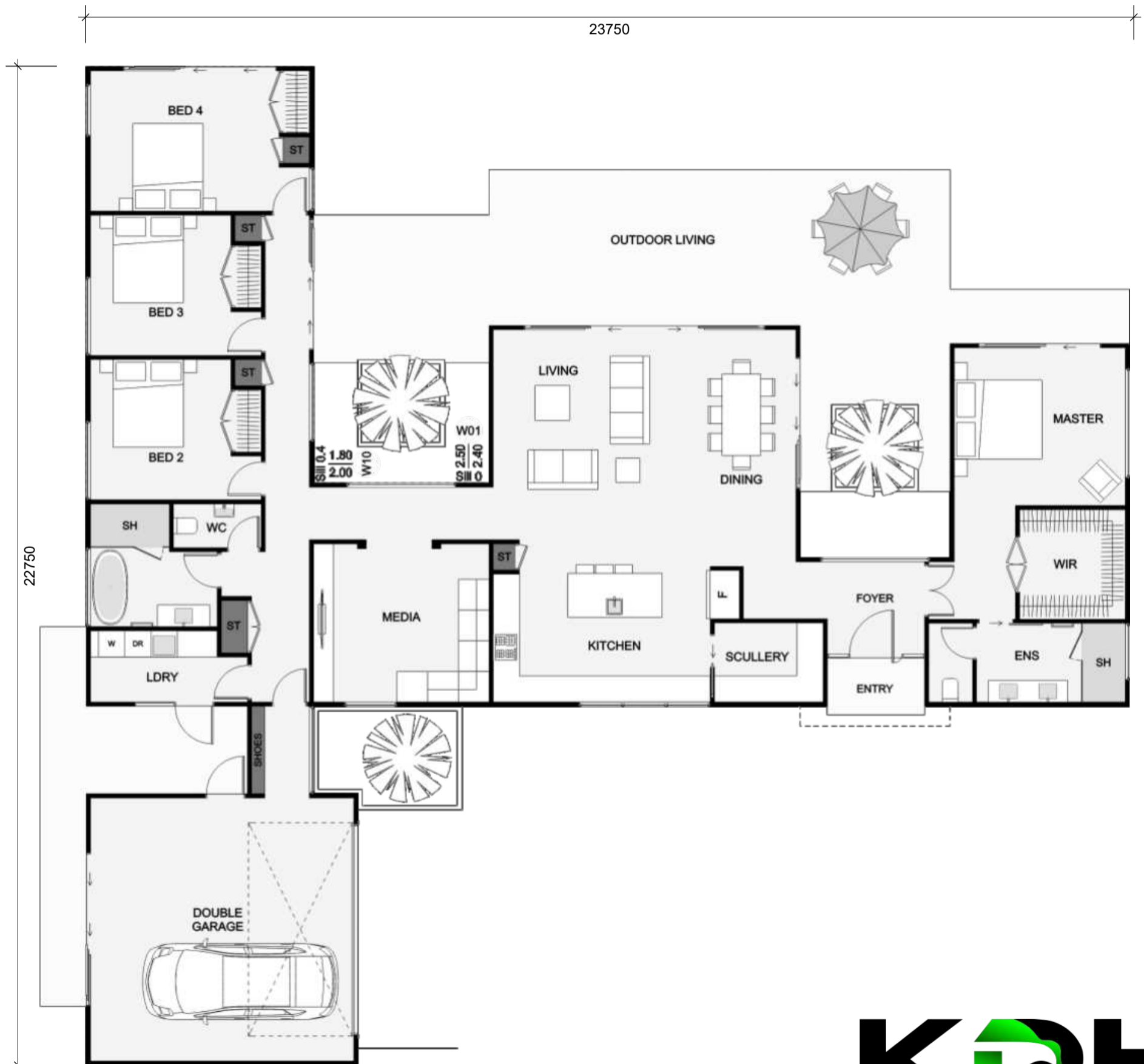
PROPOSED FLOOR PLAN FLOOR AREA: 241 (TO OUTSIDE OF TIMBER FRAMING)